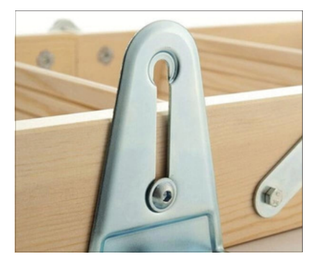
Unique detachable ladder enables one person installation