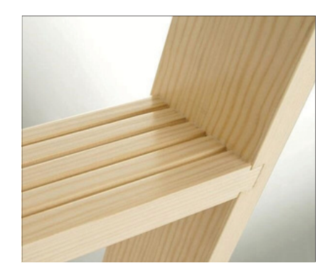
Dovetail joints on all treads