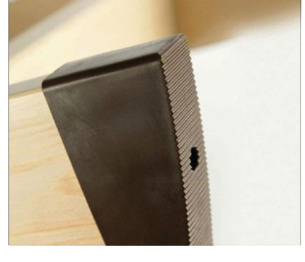
Scratch resistant protective feet